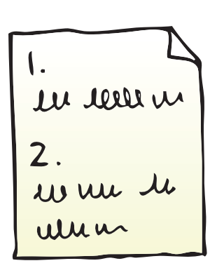
Notes or a list of questions you might have