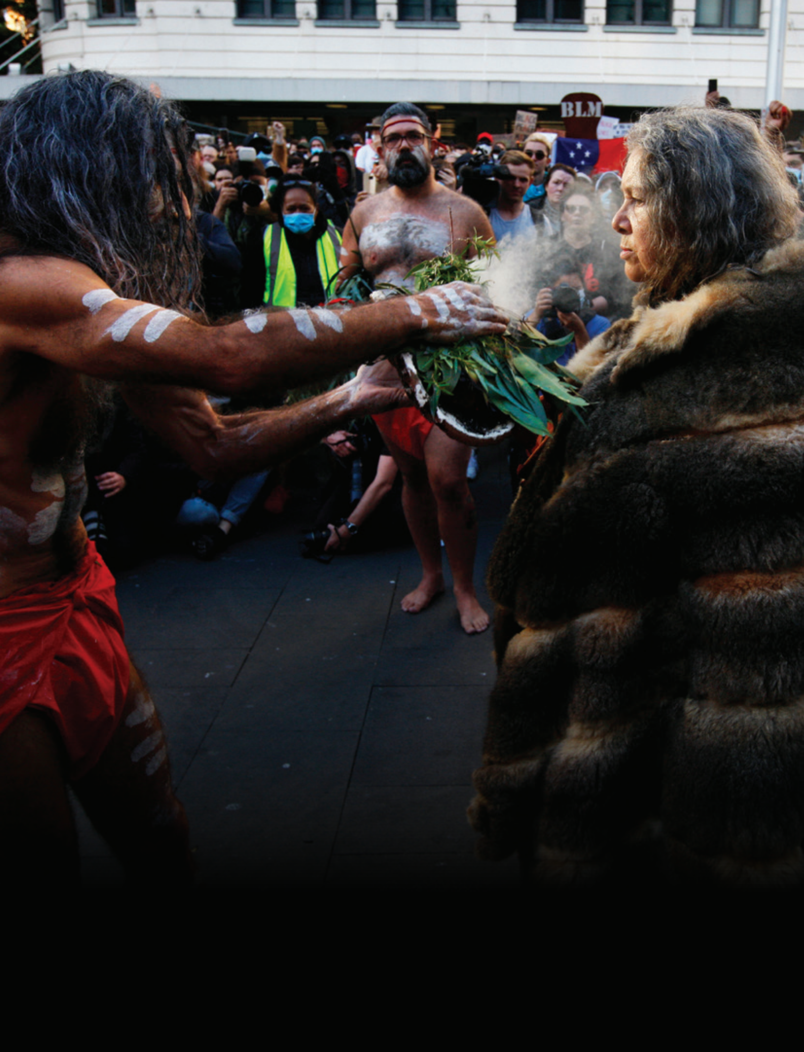
Photo: Black Lives Matter protest in Sydney Central, June 2020